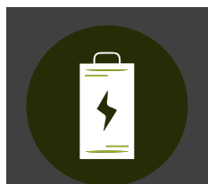
Low Power Consumption